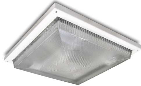
Drop Pyramidal (DP) Lens - Standard