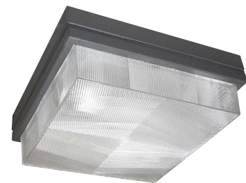
Drop Square (DS) Lens & Back Box (BB) Options