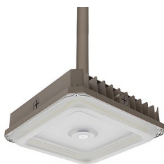
Pendant Mount (PEND)