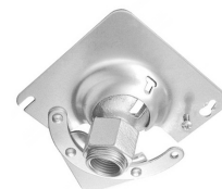
Swivel Canopy 4" for Square J-BOX (SWC-SR)