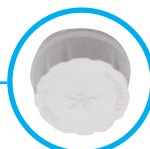
Microwave Motion Sensor (OCC) Plug-and-Play Installation