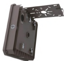
Surface Mount (SM)