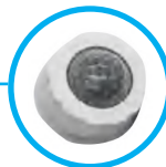
PIR Motion Sensor (PIR) Plug-and-Play Installation