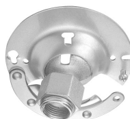
Swivel Canopy 4" for Round/Octagonal J-BOX (SWC-RR)