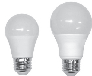
A15 For Sonar Small (Lamps by Others) A15 For Sonar Large (Lamps by Others)