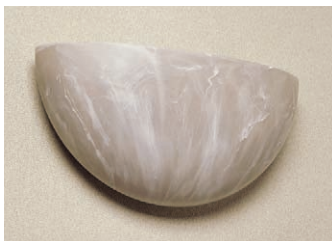
Optional Faux Alabaster (FA) and Less Trim (LT)