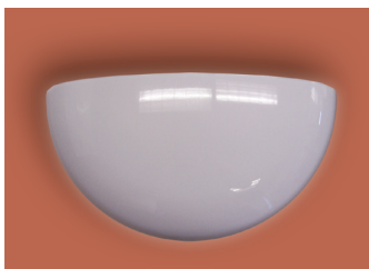
Optional Less Trim (LT)