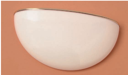
Quarter Sphere with Polished Brass Trim (PBT)—STANDARD