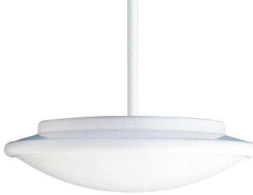
Pendant Mount (PEND12) Shown with Standard 12" Stem