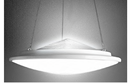
10' Aircraft Cable Suspension (AC10) Shown with Uplight (UPL) Option