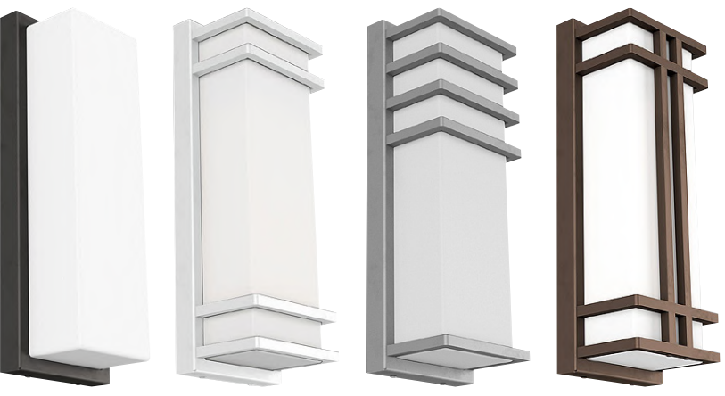
Gael Neptune (GANE)