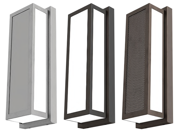
Solid Front (SF) Rectangular Windows (RW)

Dimensions: 14^{\prime\prime} H x 5^{\prime\prime} W x 3\frac{1}{2}^{\prime\prime} D