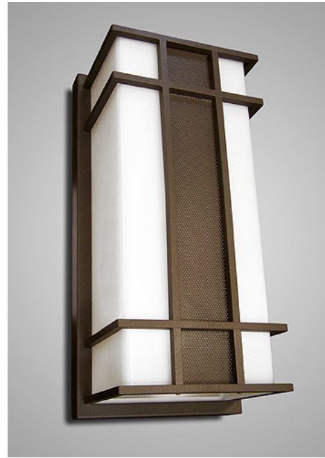
ZEUS L - XL3