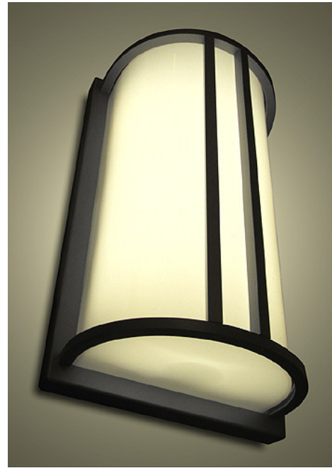
VIRGO M – XL3