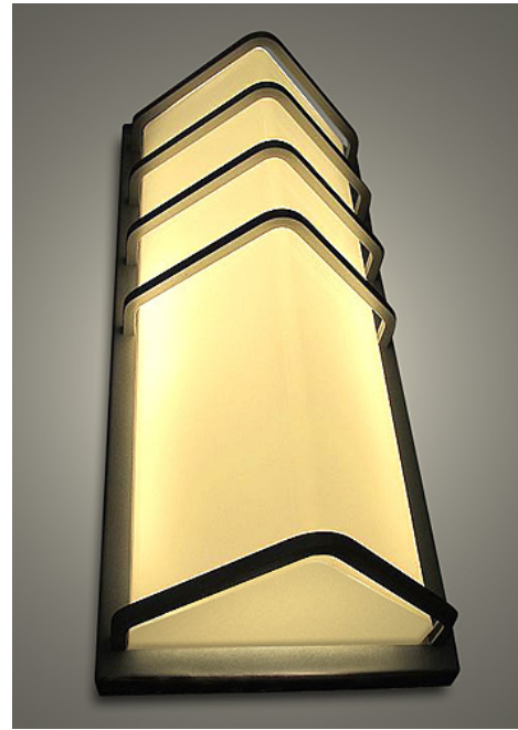
VIKING L – XL3