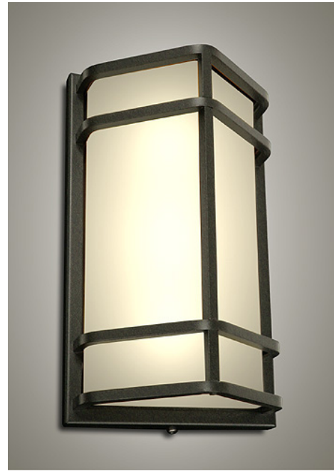
TRITON L – XL3