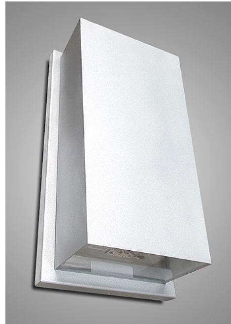
TITAN M - XL3