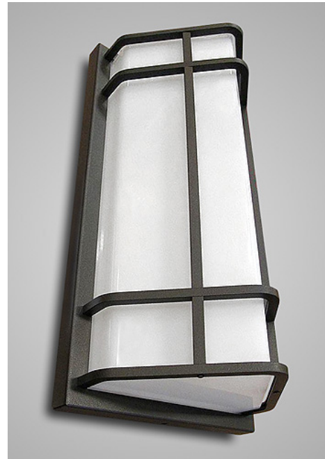
THOR L – XL3