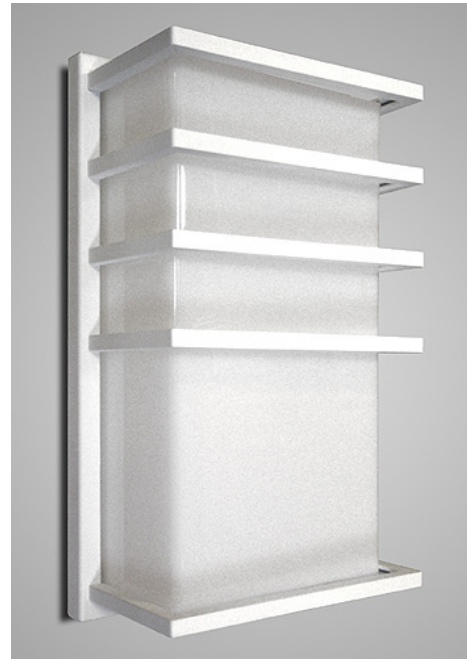
ORION L – XL3