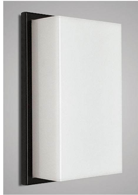
NEPTUNE M - XL3