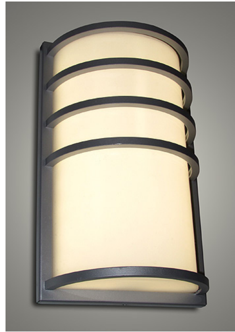
MARINER M – XL3