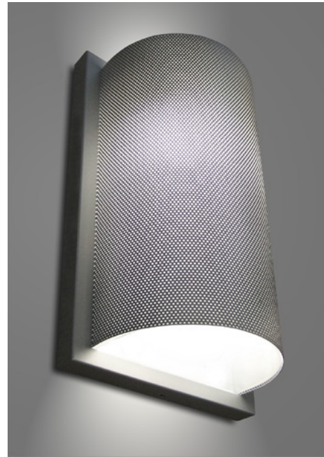
LUNAR M – XL3