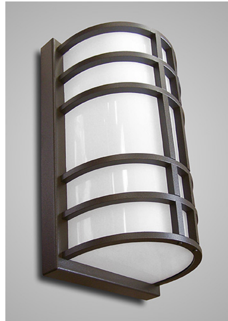
LIBRA XL – XL3