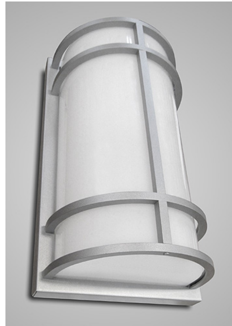
LEO L – XL3