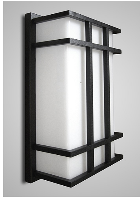
JUPITER M - XL3