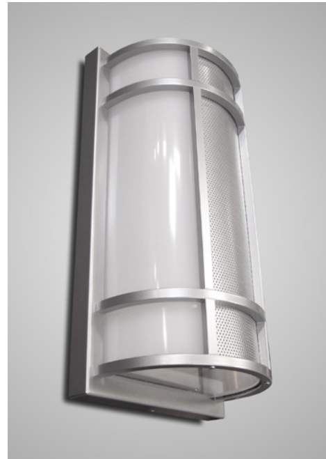
HERA L – XL3