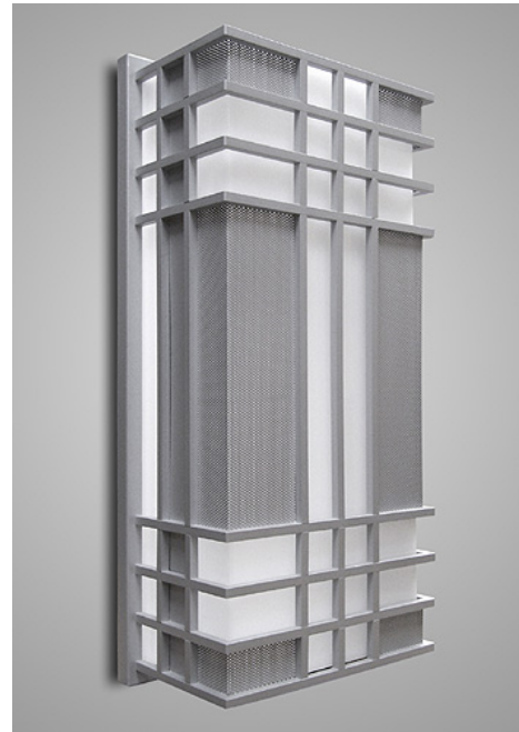
EQUINOX XL – XL3