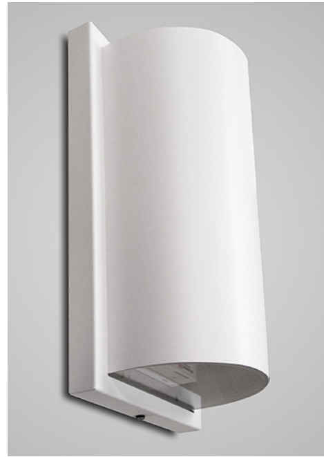
COMET M - XL3