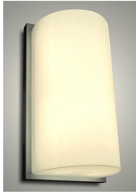
CLASSIC M – XL3