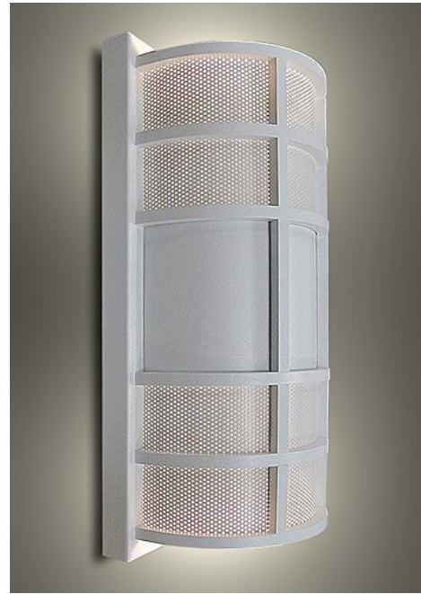
CAPRICORN XL – XL3