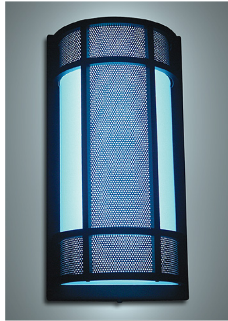
ARTEMIS L – XL3