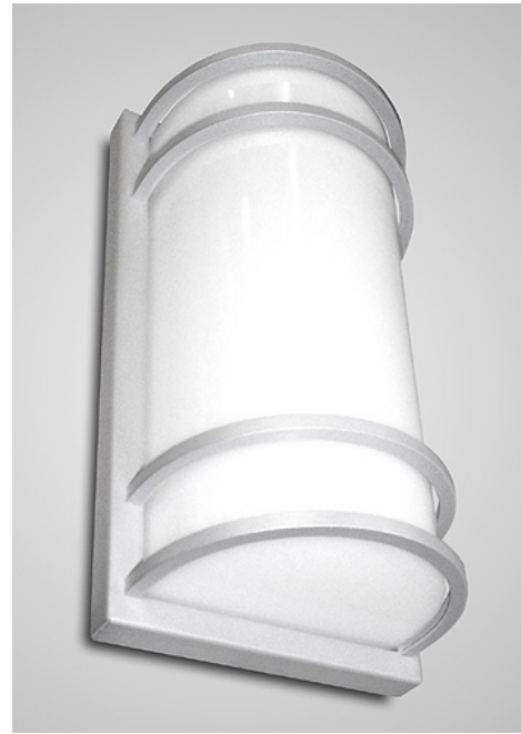
◁ APOLLO M - XL3