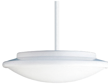
Pendant Mount (PEND12) Shown with Standard 12" Stem