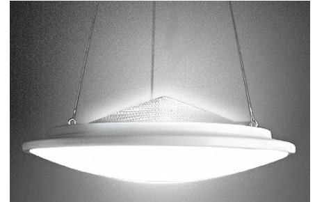
10' Aircraft Cable Suspension (AC10) Shown with Uplight (UPL) Option